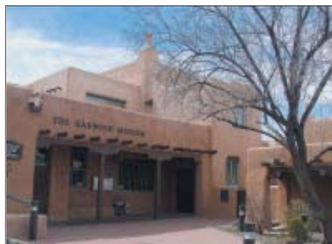
Harwood Museum of Art

founded in 1923 and is the state's second-oldest museum and a real treasury of Taos art. You'll find paintings, prints, sculpture, and photographs created by the artists who put Taos on the map as an art center. The building is an outstanding example of Spanish-Pueblo architecture. Our last stop will be at the La Hacienda de los Martinez . Bought by Don