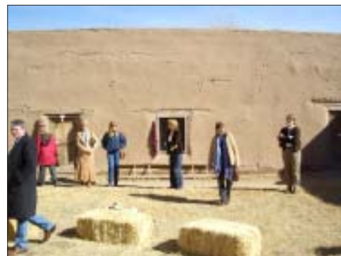
La Hacienda de los Martinez