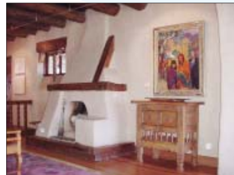
Fireplace at the Fechin House Studio

Indulge in a variety of food and art as you marvel at the collections in three of Taos' best museums. See examples of Taos Art Society art, contemporary Taos art, and one of the earliest and most historic buildings in Taos. Taos Art Museum is located in the historic home of Russian born artist, Nicolai Fechin. The museum's permanent collection includes paintings by the founders of the Taos Society of Artists, the Taos Moderns and Nicolai Fechin. The Fechin House is on the National Register of Historic Places and is filled with his hand carved doors, windows and furniture. The Harwood Museum of Art was